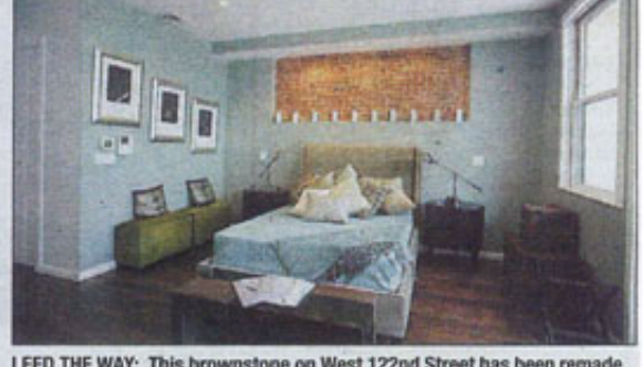
LEED THE WAY: This brownstone on West 122nd Street has been remade into a green oasis with features including recycled wood, environmentally friendly paint and insulation that was created from shredded blue jeans.

"I'd describe the look as ecofriendly-can-be-beautiful,"