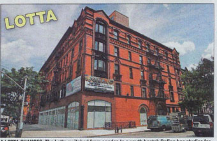
A LOTTA CHANGES: The Lotta switched from condos to a youth hostel; Dafina has studios for around $300,000; The Fitzgerald's developer offers financing for buyers; SOHA 118 has 93 units and shares a courtyard with Brownstone Lane, a nearly sold-out condo development.